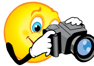
PHOTO STUDIO OPEN TODAY

The Blood Mobile is here today from 9:30 am—2:30 pm. Please donate if you are able to do so.