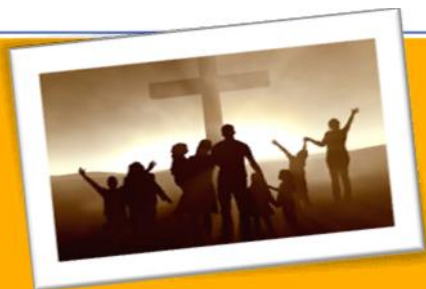
West Broward Youth Celebrating Jesus!

If you are being tormented by guilt or feelings of failure in this area, confess your thoughts to God, pray about it, put it in God’s hands, and then stand up and proclaim the truth. Say, “God loves my child. I love my child. Other people love my child. If my child doesn’t feel loved, it’s because he/she has believed the lies of the enemy. We refuse to live according to Satan’s lies.