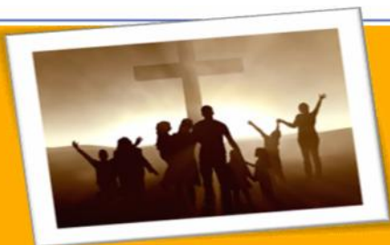
West Broward Youth Celebrating Jesus!