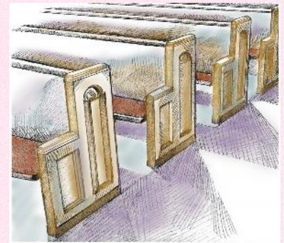
View from the Pews