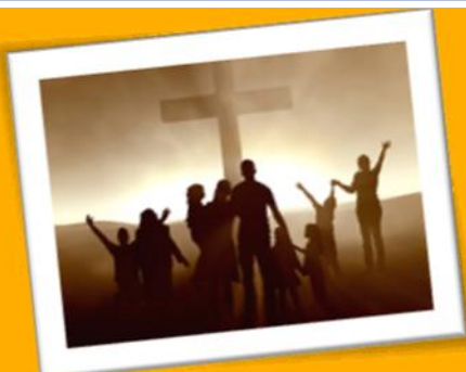
West Broward Youth Celebrating Jesus!