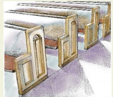
View from the Pews