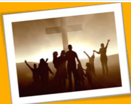
West Broward Youth Celebrating Jesus!