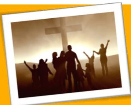
West Broward Youth Celebrating Jesus!