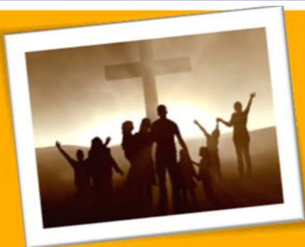
West Broward Youth Celebrating Jesus!