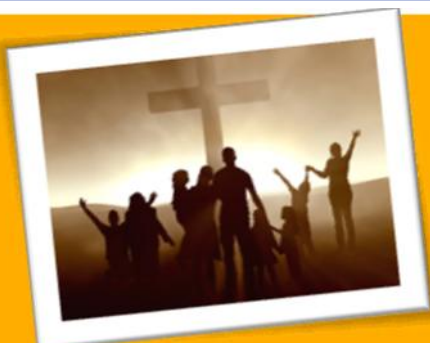
West Broward Youth Celebrating Jesus!