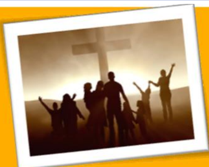
West Broward Youth Celebrating Jesus!