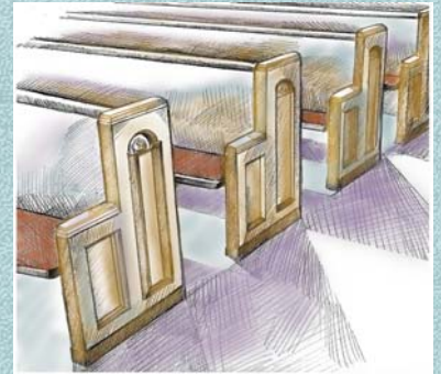
View from the Pews