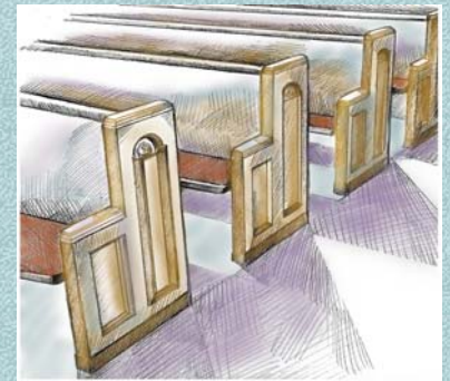
View from the Pews